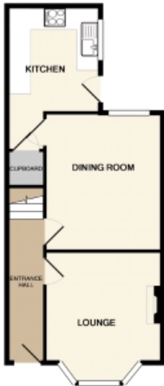
GROUND FLOOR APPROX. FLOOR AREA 41.5 SQ.M. (447 SQ.FT.)