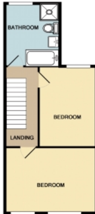
1ST FLOOR APPROX. FLOOR AREA 40.4 SQ.M. (435 SQ.FT.)